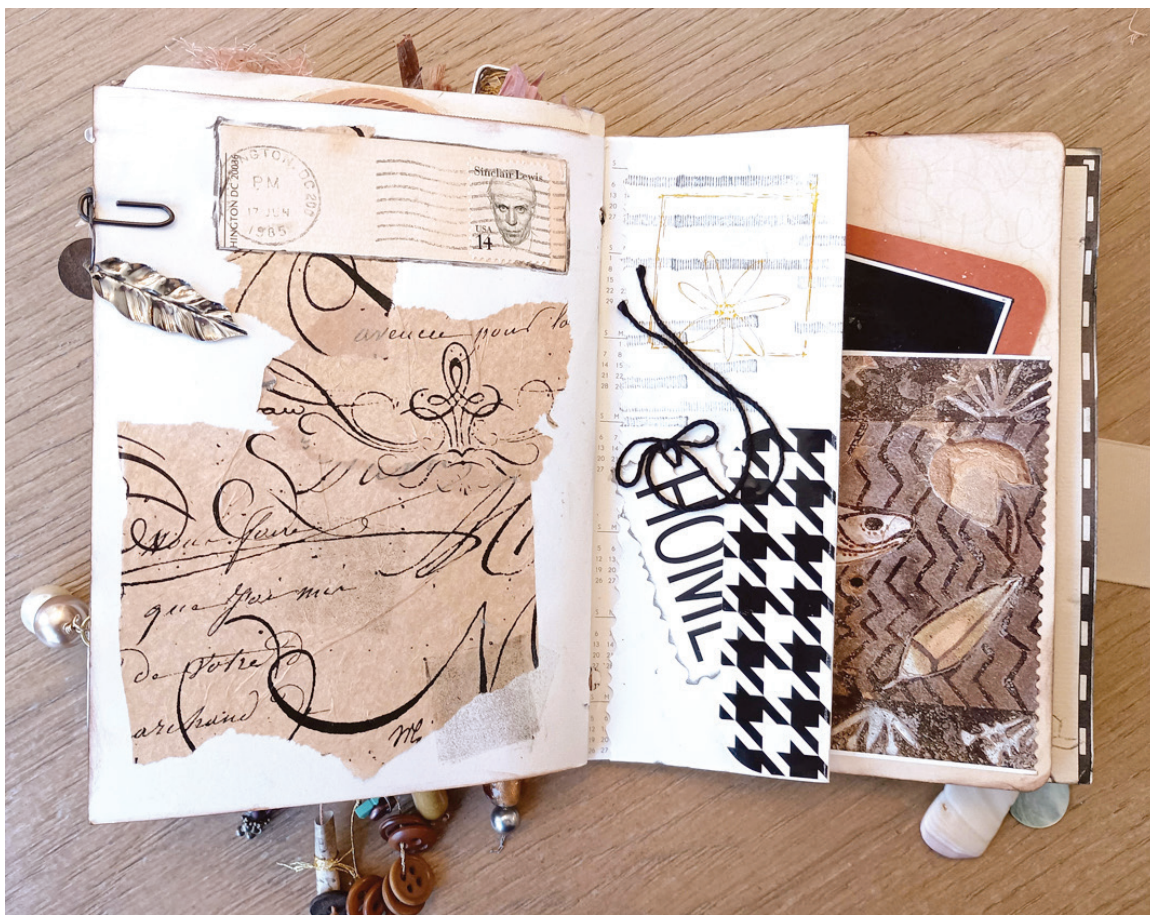
The seventh Arlington Visual Art Studio Tour takes place Sept. 21-22, 2024 at 59 art studios in Arlington.