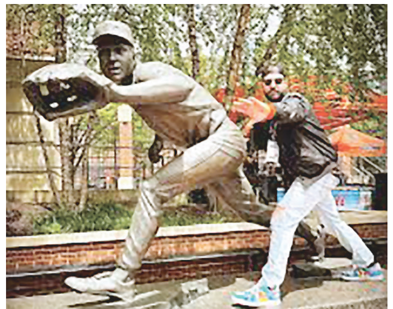
Catch 90s & 00s Hits with cover band Uncle Jesse on July 25, 2024 at Rosslyn LIVE.

Wine Tasting Benefit. 2-4 p.m. At Pirouette Restaurant & Wine Shop, 4000 N. Fairfax Drive, Suite C, Arlington. To benefit PathForward; Pirouette will donate 15% of wine and ticket sales. $25 ticket