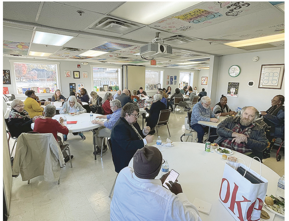
Guests and Volunteers join together for a meal in the fellowship hall following a recent worship service. This is one of 6 lunches offered throughout the week.