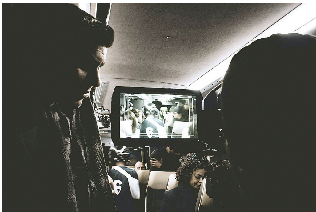
Scene from previous film "Imposter" shot on a bus