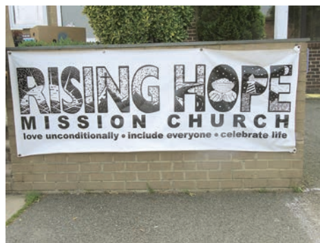
The sign at Rising Hope Mission Church.