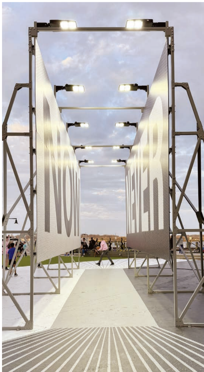
Now or Never, a public art display, opened March 21 at Waterfront Park.

Eggert, a Texas-based artist known for text-based sculptures that explore language and time, was selected for the 2026 installation following a competitive review process by the Alexandria