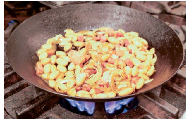
White beans, garlic and onion added to skillet.