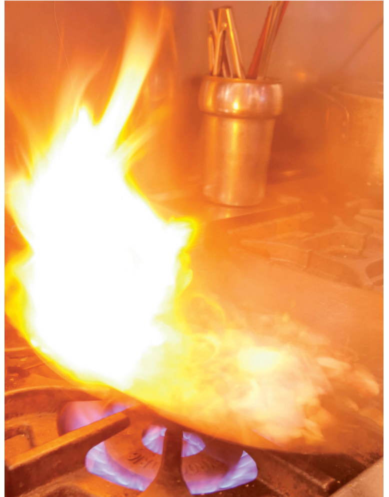
Chardonnay added to deglaze garlic and shallots.