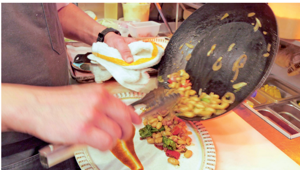
Relish spooned onto plate alongside smear of lobster sauce.