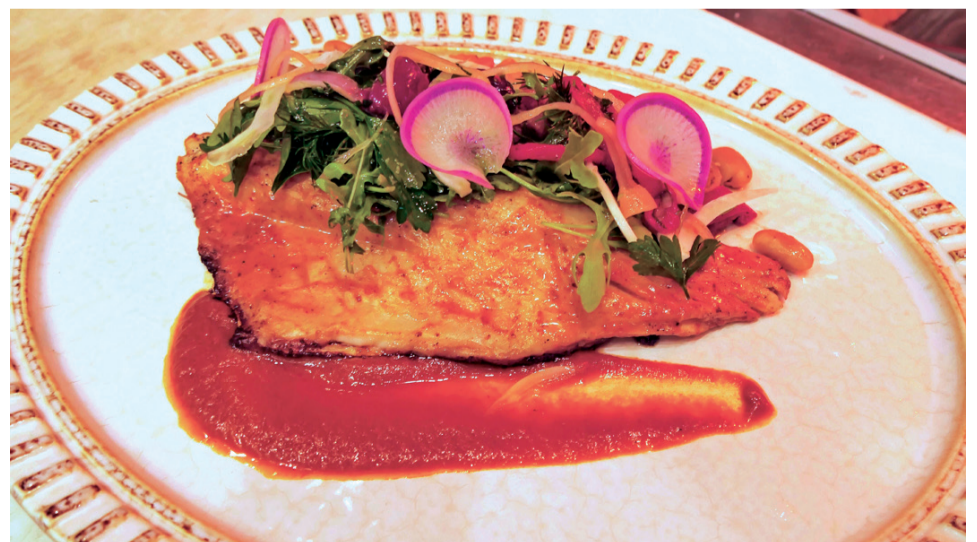
Grand finale—Branzino with fennel-olive relish.