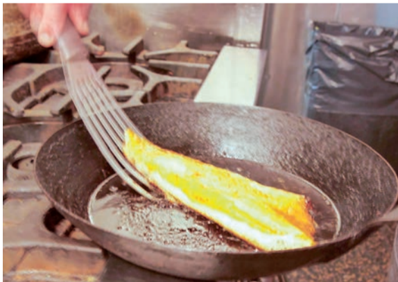
Branzino seared and ready for oven.