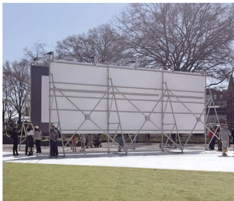
Now or Never features two billboards on display at Waterfront Park.