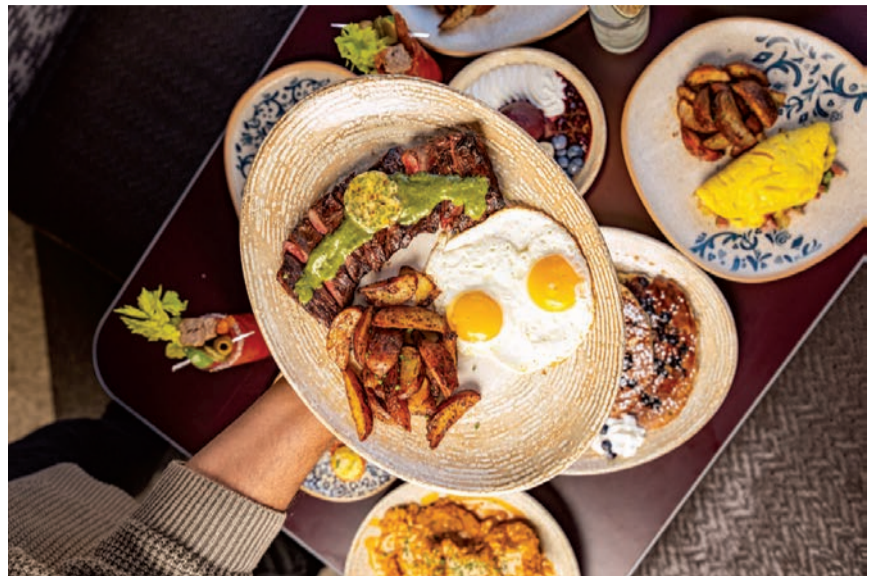
Enjoy Breakfast with the Easter Bunny at Alexandria restaurants April 4-5, 2026.

Services Offered Include: Marriage License Issuance