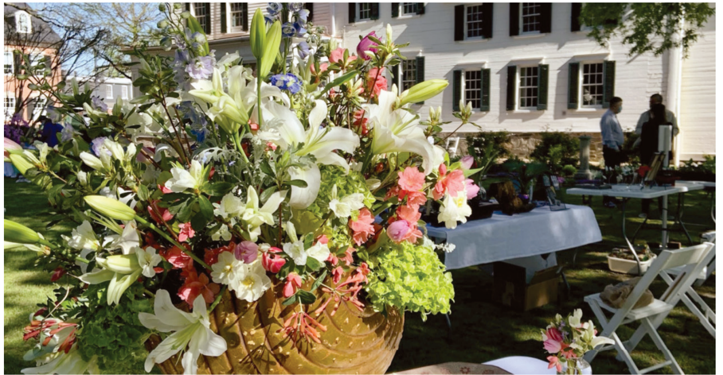
The Historic Garden Week Old Town Alexandria House and Garden Walking Tour takes place Saturday, April 18, 2026 in Alexandria.

❖ July 11: Take part in the City of Alexandria's 277th/USA 250th Birthday Celebration complete with fireworks, music and more at Oronoco Bay Park along Alexandria's waterfront.