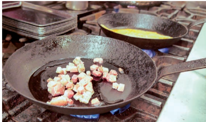
Pancetta sautéed until crispy.