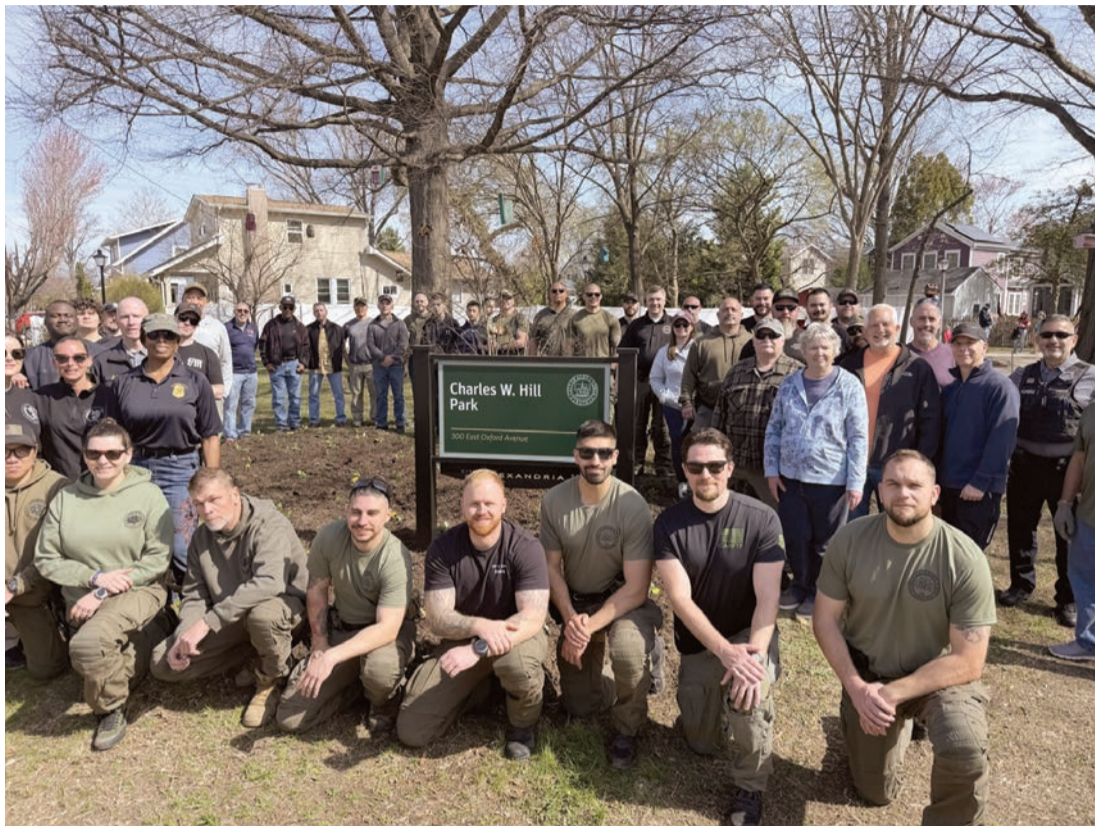
Alexandria Police Department retirees gather with volunteers for the annual Charles Hill Park clean up March 22 in Del Ray.