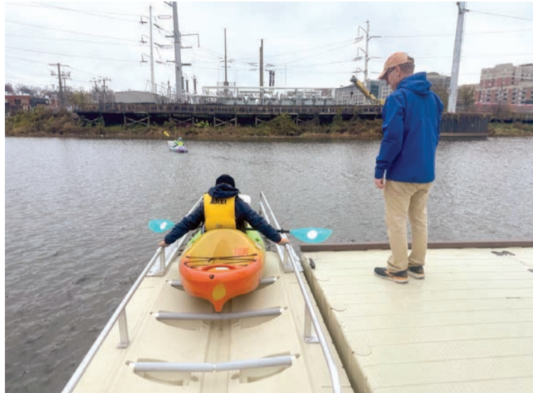
Kayak volunteer uses the roller-entry feature.

Four Mile Run is a tributary of the Potomac River across from Washington, D.C. It is an urban