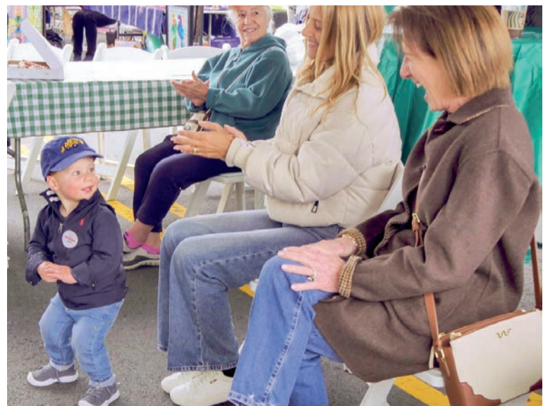
A toddler dances to the mariachi band to the delight of his relatives watching from the front row.