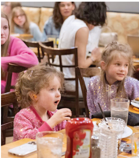
Taylor Swift impersonator surprises crowd at the raffle.

It was so amazing. The parents were so thrilled and asking if we could do it again. We had so much fun; maybe we will."