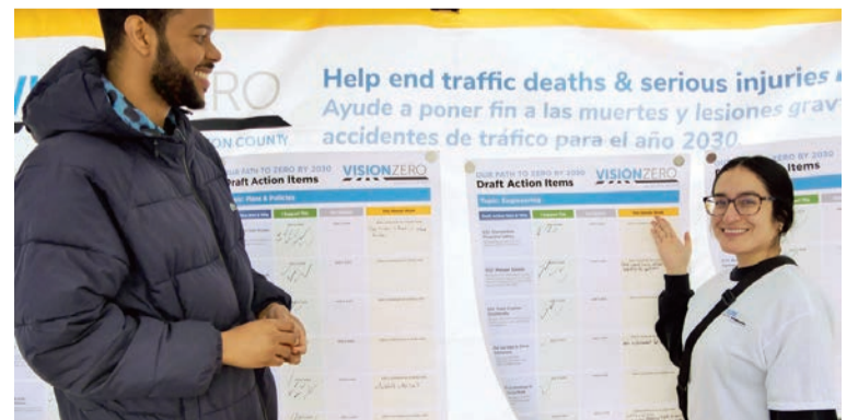
Vision Zero display invites input on County draft transportation safety action plan.

Earth Day was established 56 years ago with this year's theme "Our Power, Our Planet."