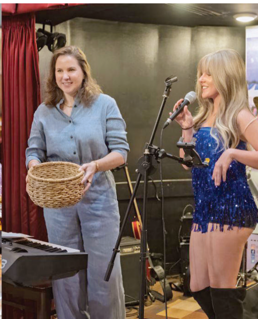
Piano & More teachers attending the 10-year celebration April 17 at Busboys & Poets