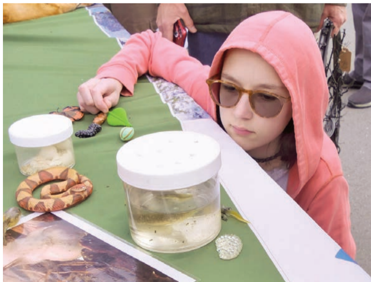
A young observer searches for the hind legs emerging from the bullfrog tadpole which came from Long Branch Nature Center