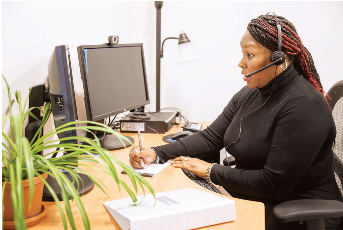
A crisis worker at HopeLink.

While we shine a light on mental health this May; there are ways each of us can help. It's important to know the signs and ways that you can make a difference. This