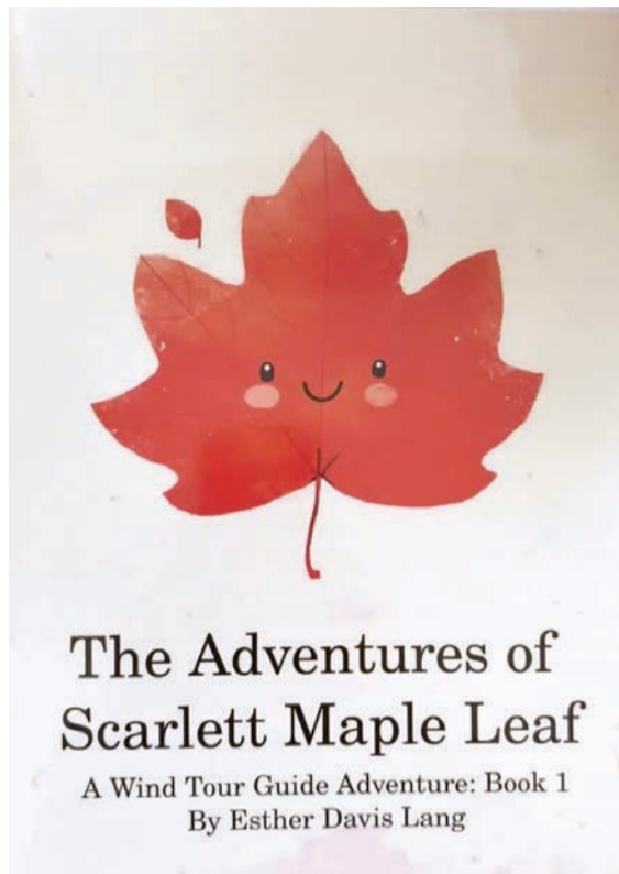
Inspired by a lifelong love of storytelling, Lang's children's books, including The Adventures of Scarlett Maple Leaf , reflect the same creativity and optimism that have shaped her journey for more than a century.