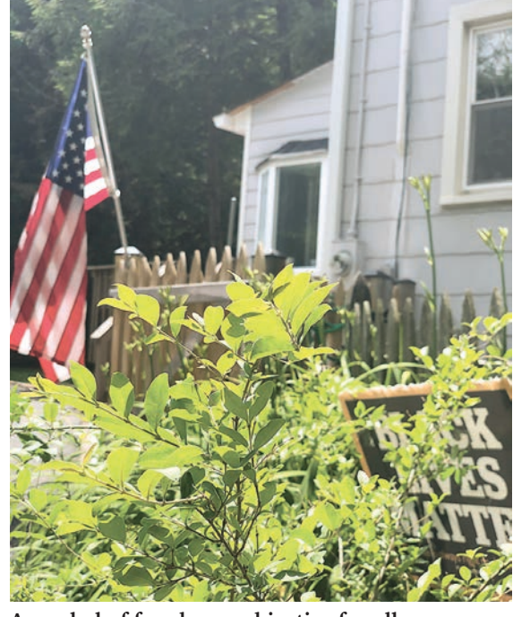
A symbol of freedom and justice for all.

The colors in the flag matter: red for hardiness and valor, white for purity and innocence, blue for vigilance, perseverance, and justice. Hanging the flag on June 14th can affirm that unity, belief in the ideals of the constitution, and that justice, valor, and purity remain a priority for most Americans — and have not gone out of fashion.