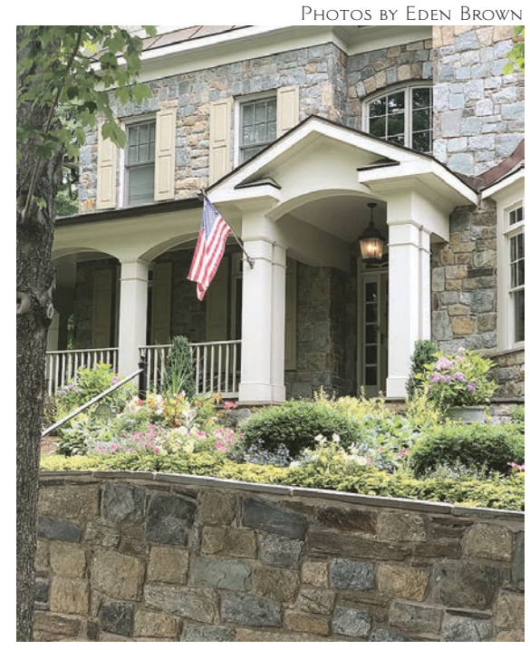
It's a grand old flag.