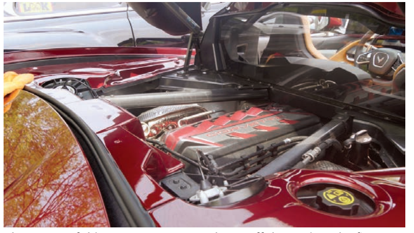
The owner of this 2020 C8 Corvette shows off the engine, the first year the Corvette engine had been moved from front to rear.