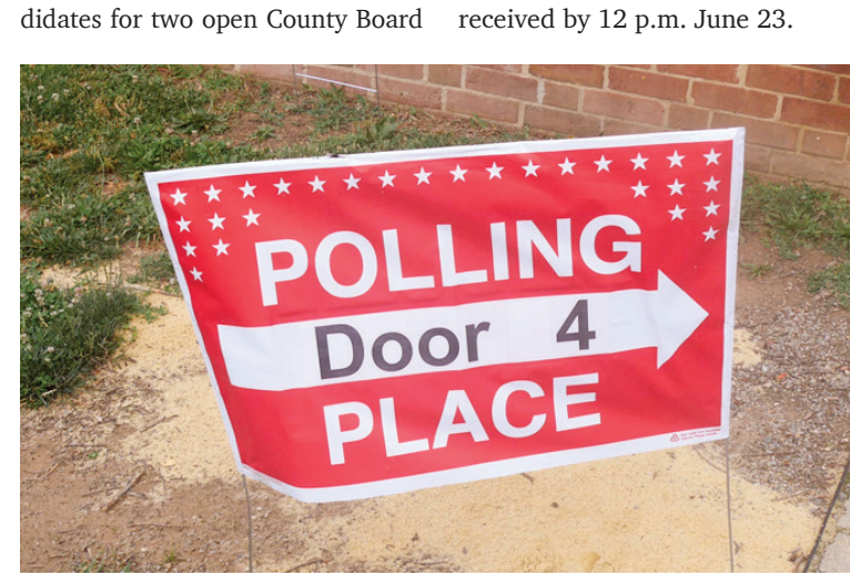
Election Day, June 20. All Arlington polling places are open from 6 a.m. to 7 p.m. Arlington Connection & June 21-27, 2023 & 3