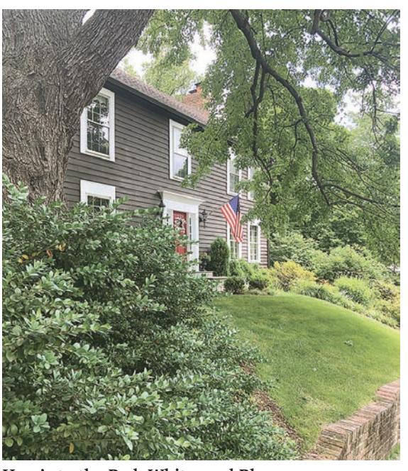
Here's to the Red, White, and Blue.