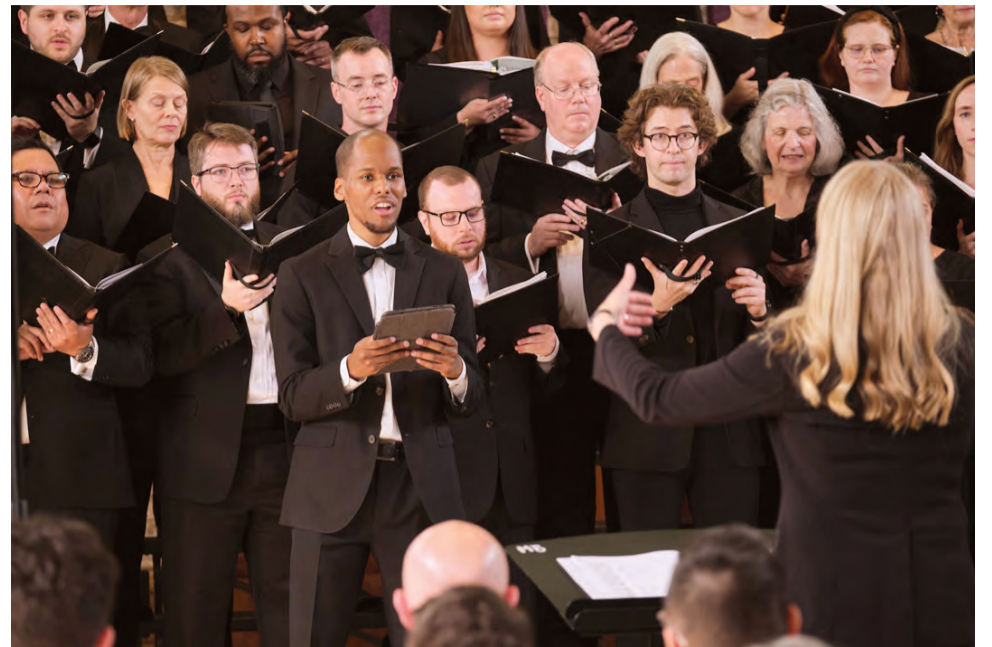
Members of the Arlington Chorale perform at their June 11, 2023 concert We Stand Together at the Unitarian Universalist Church of Arlington.