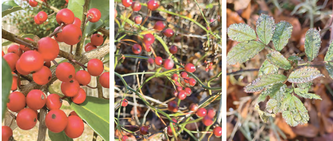
American Holly (LLex opaca) a native tree to our area, is often used for holiday decoration, its berries enjoyed by birds

https://xerces.org/leave-the-leaves www.ConnectionNewspapers.com