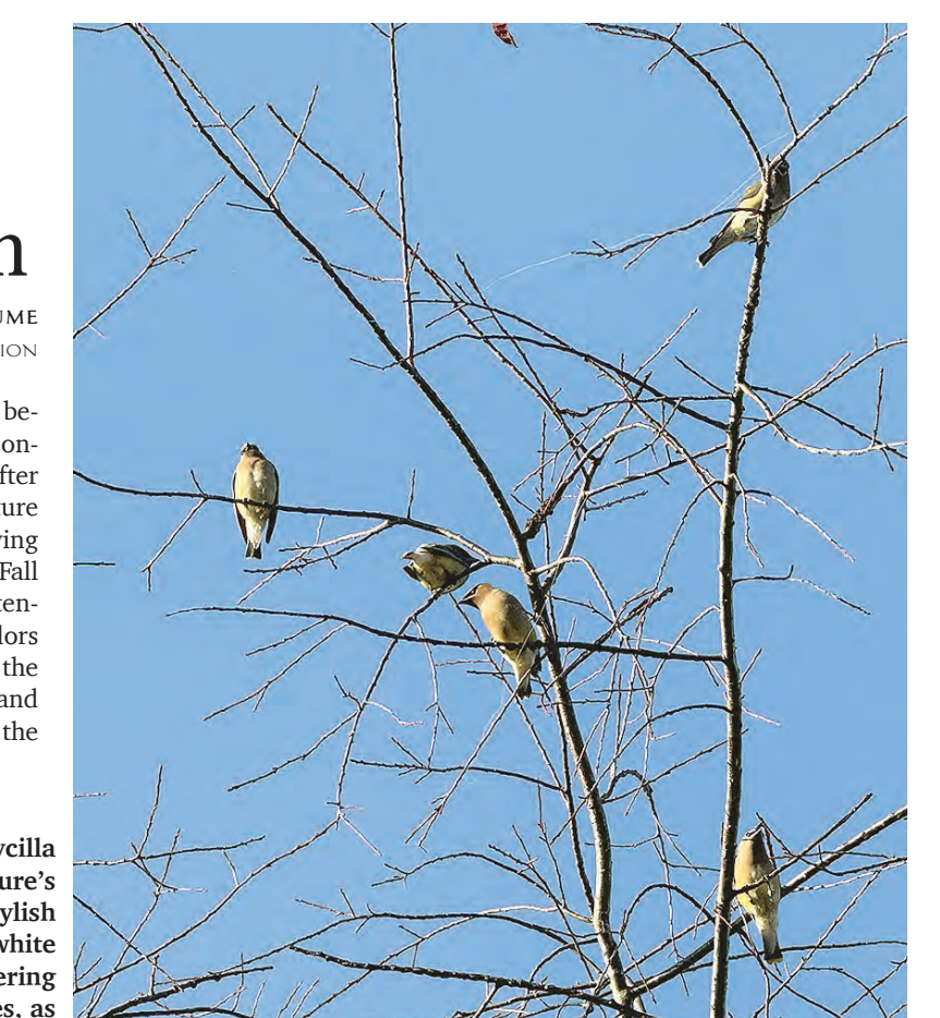
Berries of Amur honeysuckle (Lancer maackii), another non-native invasive plant, are mildly poisonous if eaten, though enjoyed by birds.