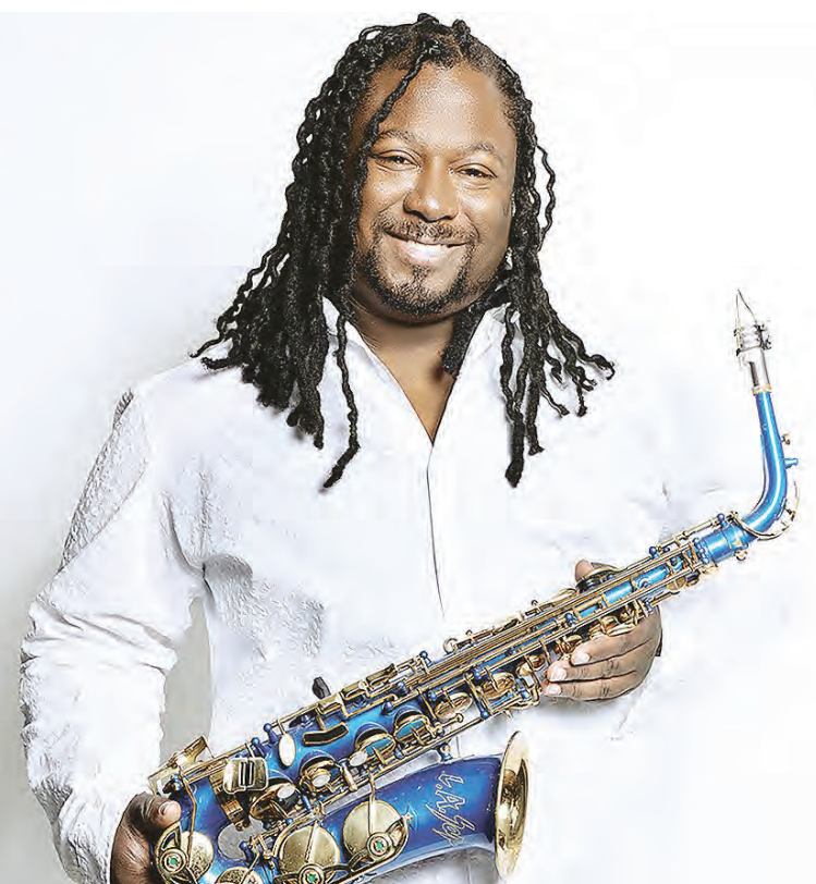
"It's a Jazzy Christmas" will be held on Saturday, Dec. 9, 2023 at the McLean Community Center in McLean.

in the holiday celebration as they walk through the Enchanted Forest and can vote for their favorite tree theme, most creative tree or most originality. Following the event, all trees will be donated to less fortunate families in the Reston community. The event is free for all Reston Association members; admission is $8 for non-members ages 3-17, and $18 for non-members 18+. Registration is open at https://www.reston.org/winterfest-2023.