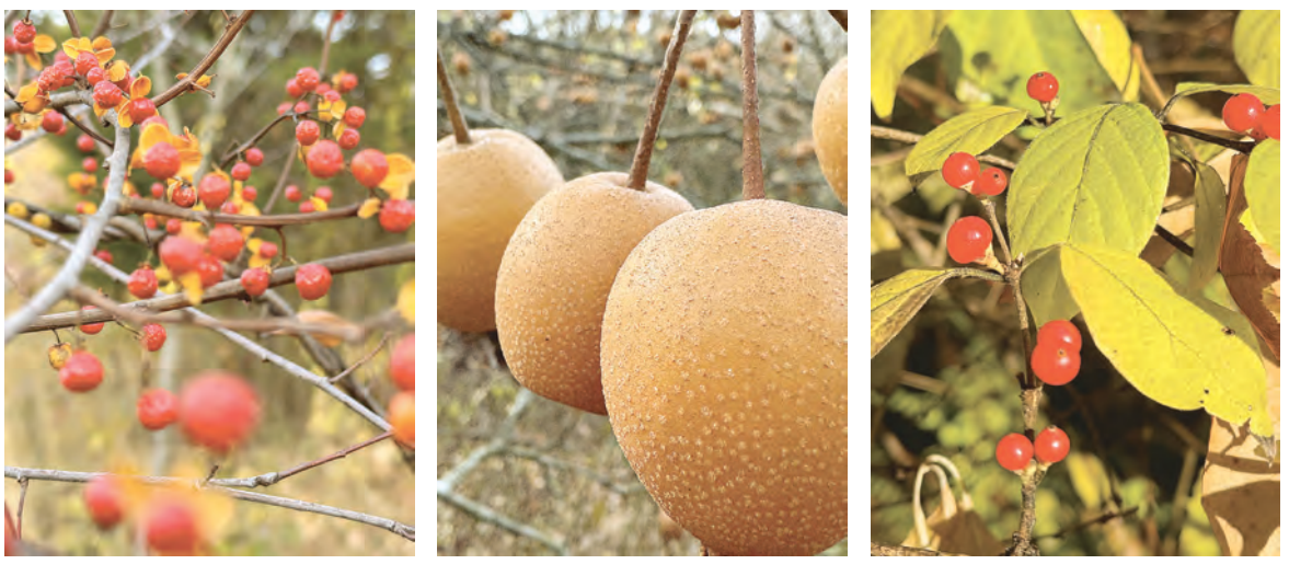
Invasive vines of Oriental Bittersweet are easy to spot for removal this time of year with their distinctive colorful berries.