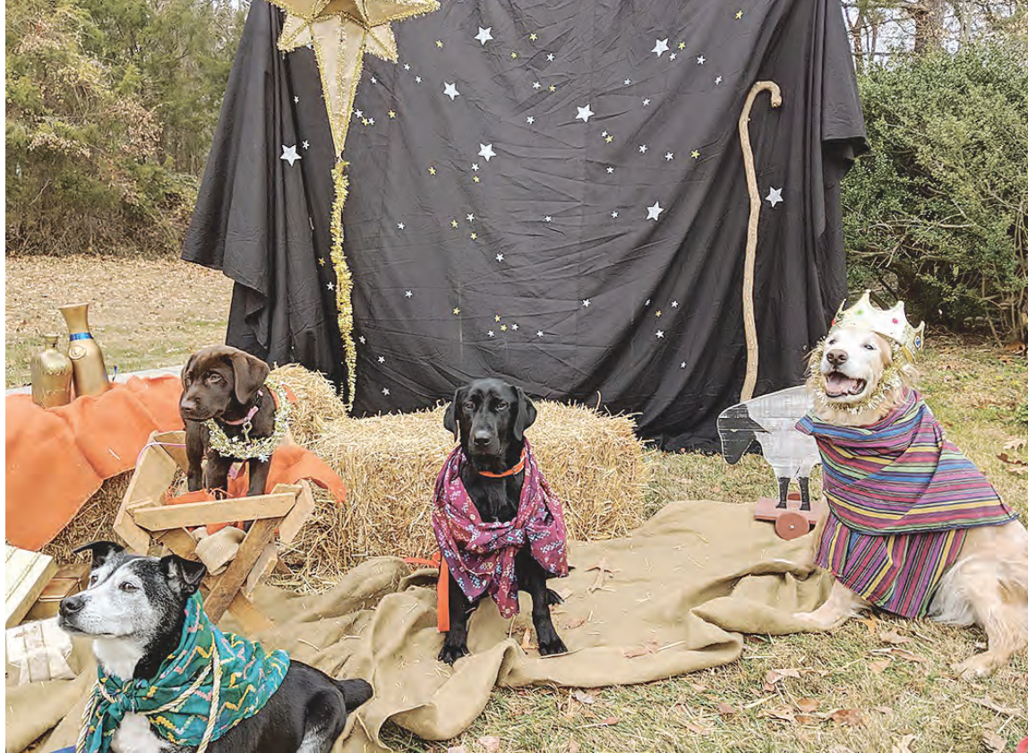
A Puppy Nativity will be held at Church of the Good Shepherd in Vienna on Saturday, Dec. 2, 2023.