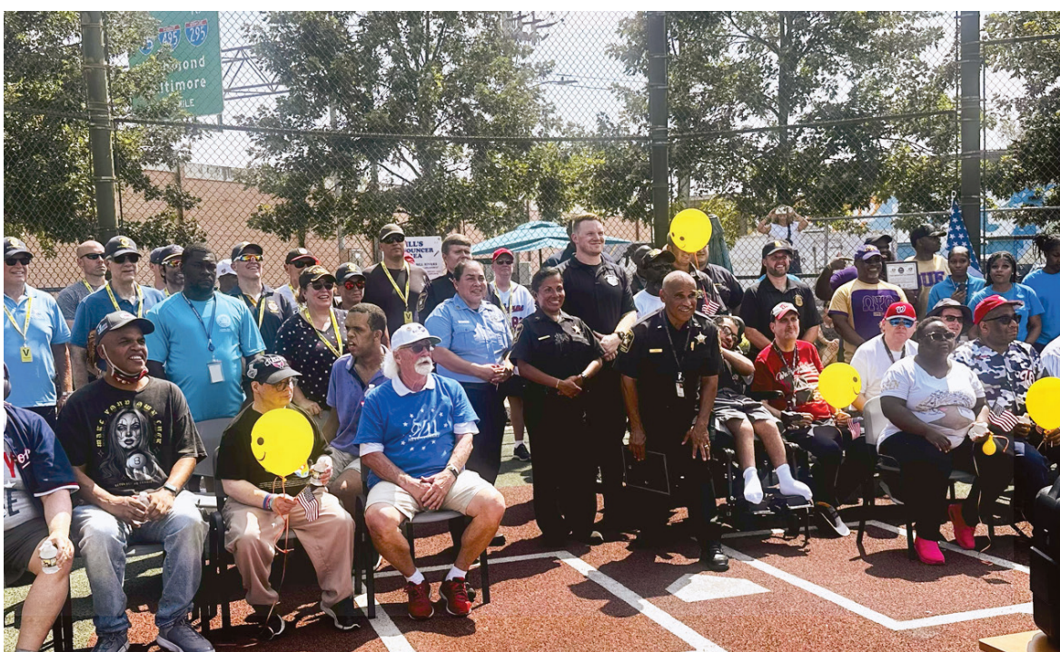
Members of the Miracle League of Alexandria pose for a team photo with first responders and volunteers prior to the Sept. 6 game in honor of first responders Sept. 6 at the Nannie J. League Recreation Center.