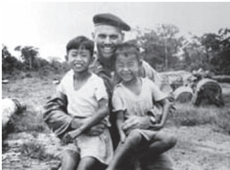
Humbert "Rocky" Versace, shown in an undated photo taken in Southeast Asia, remains missing in action from the Vietnam War.

MIA Recognition Day Ceremony is free and open to the public. It will also be livestreamed at www.dvidshub.net/webcast/36827