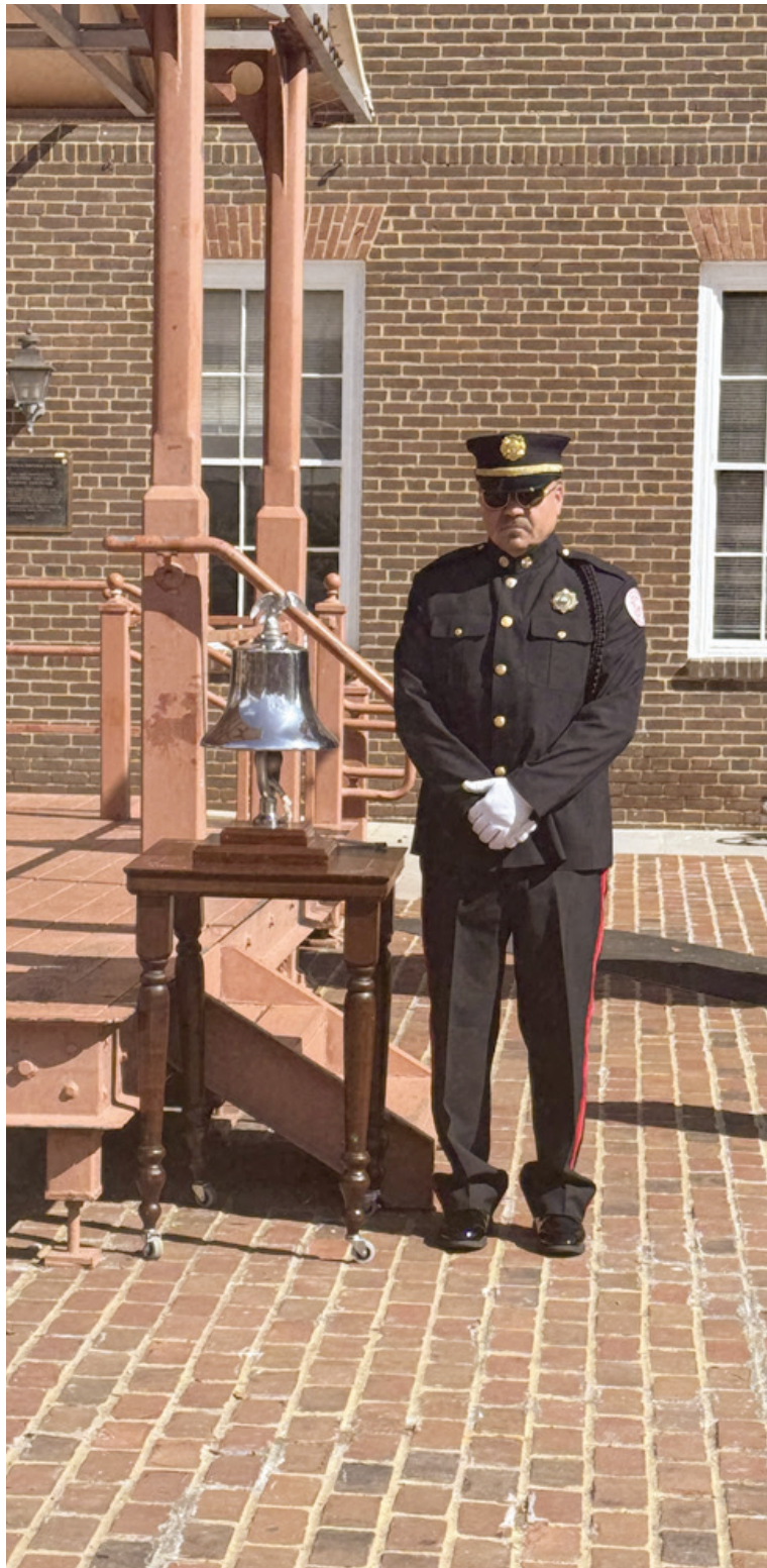
The traditional Return to Quarters bell ringing honors the victims of the 9/11 terrorist attacks.