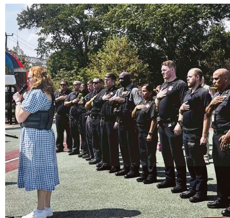
First responders stand at attention during the National Anthem Sept. 6 at the Nannie J. Lee Center.