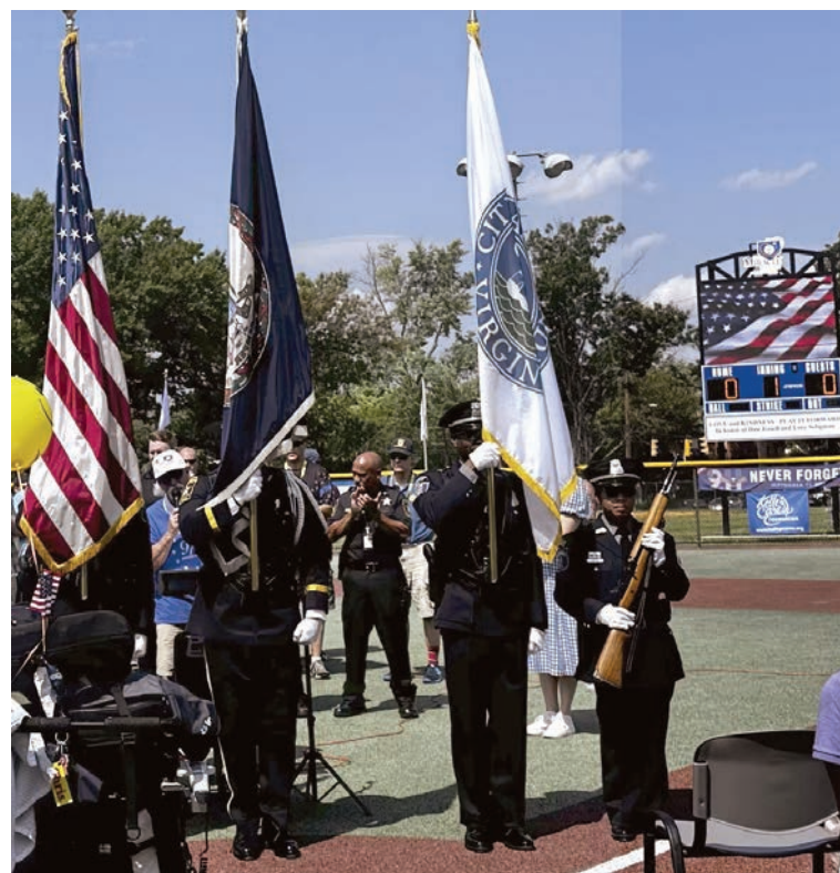
The City of Alexandria Honor Guard marches on the field at the Miracle League tribute to first responders Sept. 6 at the Nannie J. Lee Recreation Center.

Today we say thank you to our first responders who risked their lives and remember those who lost their lives for our country. All those individuals are remembered and honored today."