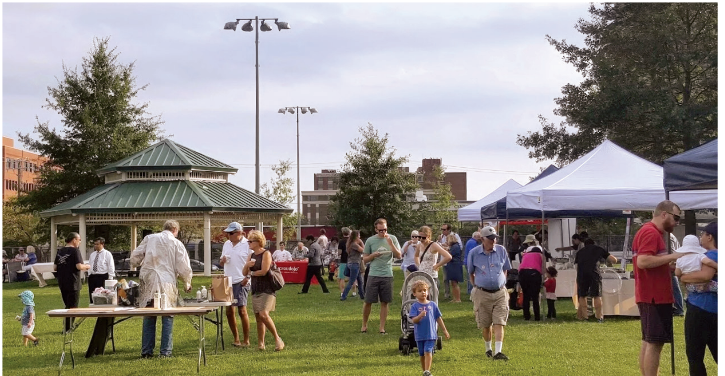
The Taste of Old Town North takes place on Thursday, Sept. 18, 2025 in Alexandria.

The "Second Time Around" exhibit at Del Ray Artisans gallery features artwork made out of recycled materials. This exhibit focuses on the thought-change concept of sustainable creativity and enhancing artistic environmental ethos, from the art to the earth-conscious workshops and events. View at Del Ray Artisans, 2704 Mount Vernon Avenue, Alexandria. Opening Reception: Friday, September 5, 7-9 p.m.. Gallery hours: Thursdays 12-6